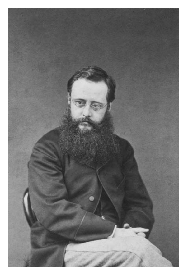
Figure 1. Photograph of Wilkie Collins 1864 by Cundall Downes & Co. Reproduced with the permission of Paul Lewis.

above his right eye. In the 1850s he took advantage of the mid-Victorian fashion for long beards in an attempt to hide the striking disproportion of his upper and lower body (see fig. 1).