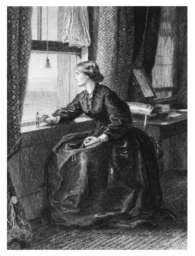
Figure 2. John Everett Millais's frontispiece to the Sampson Low edition of No Name .

appeal of sensation fiction for early film. As Tom Gunning has argued, early cinema aimed, above all, to shock or thrill the viewer: 'the impact derives from a moment of crisis, prepared for and delayed, then bursting on the audience' – the train rushing towards the audience was the most vivid example.<sup>7</sup> Such tactics immediately recall sensation fiction (though without sensation fiction's complex narrative), and Gunning also locates this strand of cinema in a line of continuity with magic shows and other spectacles which tested the credulity of sophisticated and sceptical fin de siècle audiences. Like sensation fiction, early cinema provoked in the reader the question: but how can this be possible? And then went on to show us that it is – usually without any recourse to 'real' magic or matters supernatural.