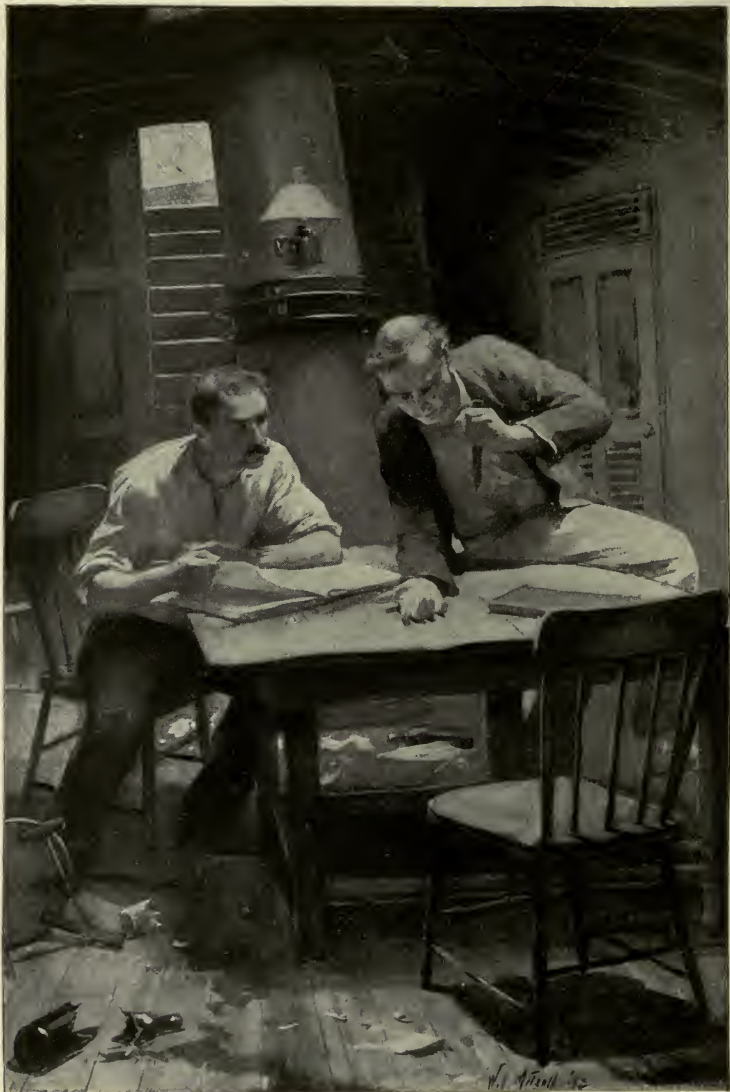
“‘That kind of an accident,’ said he” (p. 410).