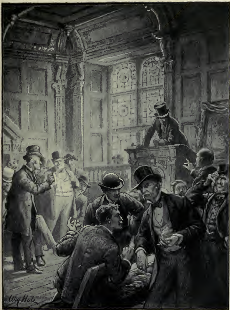
"Going at fifty thousand, the wreck of the brig Flying Scud !" (p. 148).