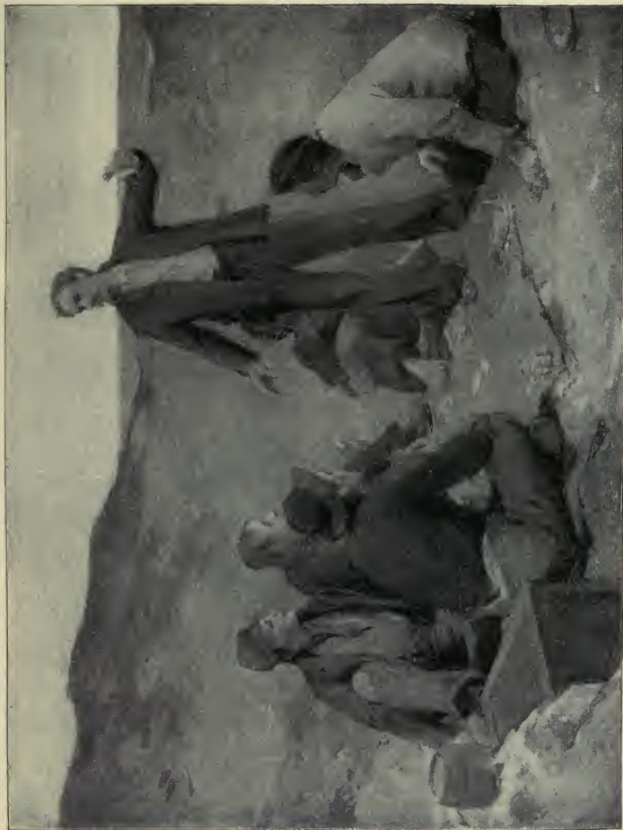
“Now he rose mechanically, shaking and stumbling like a drunkard after a debauch” (p. 382).