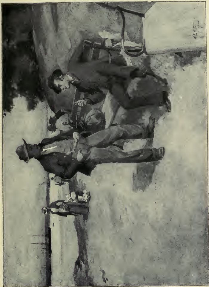
The Domain, Sydney.—“My word, no!” replied the little man, “I just sit here and read the ‘Dead Bird,’” (p. 343).