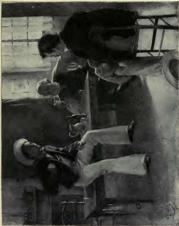
“‘I am afraid I am an American,’ I said apologetically” (p. 261).